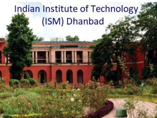
Indian Institute of Technology (ISM) Dhanbad