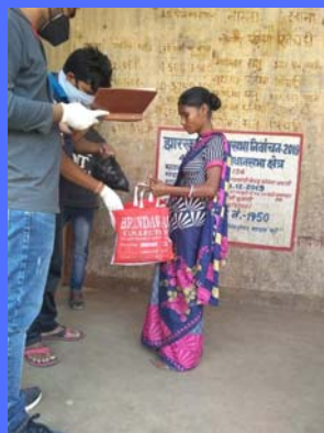
Kartavya members providing basic needs to people.

Kartavya - Dhanbad Chapter has taken up a great step and offered basic needs to the people who lack ration cards with the help of Alumni Funding.