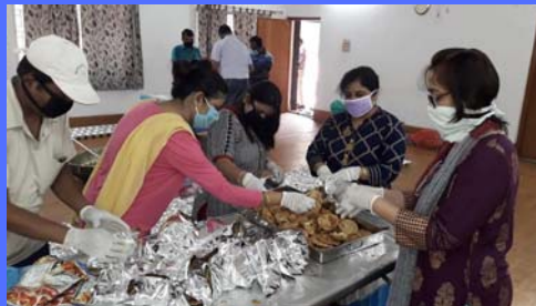
Deepti Ladies Club of IIT (ISM) Dhanbad packing food for the needy.

The Deepti Ladies Club of IIT (ISM) has been whole-heartedly supporting the Community Services Initiatives team by shouldering responsibilities that come their way.