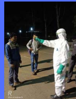
Safety at Main Gate, IIT ISM Dhanbad

Close monitoring of the situation : The Director with his team has been closely monitoring the situation caused by Covid-19 outbreak and accordingly taking decisions in a timely way and constantly updating the students, faculty and staff.