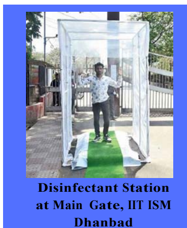
Disinfectant Station at Main Gate, IIT ISM Dhanbad