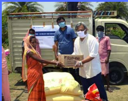
IIT-ISM helps Leprosy hit