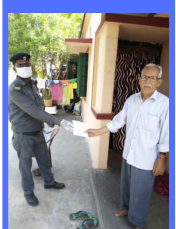
Security Guards distributing pamphlets

Following the protocols & maintaining social distancing in the campus : We are taking all the precautions necessitated by the unprecedented situation Covid-19 has created. To prevent the spread of deadly pandemic 100% lock down is being followed in the campus. Self- isolation/quarantine directives and security guidelines for Covid-19 lock down were released on 22nd March 2020. Awareness pamphlets were specifically distributed to the staff. To ensure the safety of all campus residents, essential supplies are made available in the campus, right from fresh vegetables, fruits and milk to groceries.