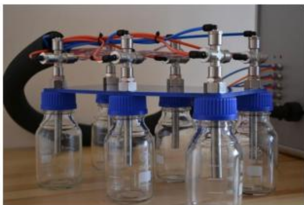
Arrangement of Cold finger with bottles (image for Ref. only)