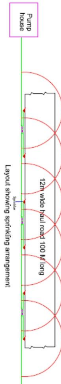
Fig. 1 Sprinkling System