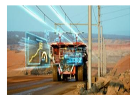
Al based traffic Management System