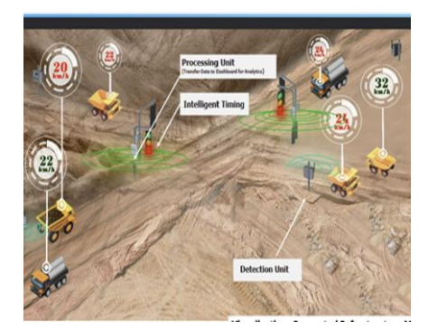
Al-based Smart Traffic Management and collision avoidance system in mines