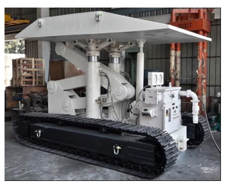
Heavy-duty 500t SAGES with a remote radio-controlled and digital display system