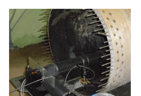
Equipment for cutting of Composite Hardware (used canister)