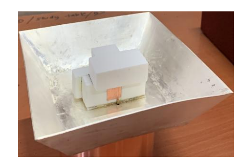
High Power Handling Dielectric Resonator Antenna