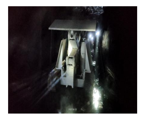
Smart Traffic Management System for Safety and Congestion-Cut Using Al