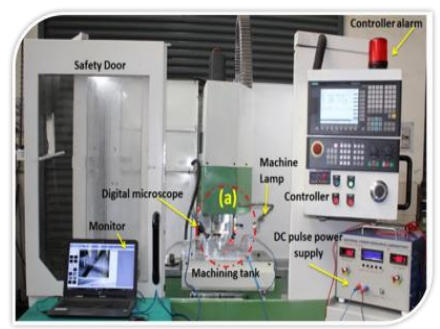
Hybrid micro machining technology using µ-ECM and µ-EDM processes