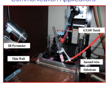
Direct energy deposition facility