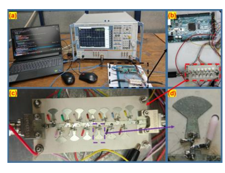
Ceramic Antenna Array with Load modulator for Modern Communication Applications