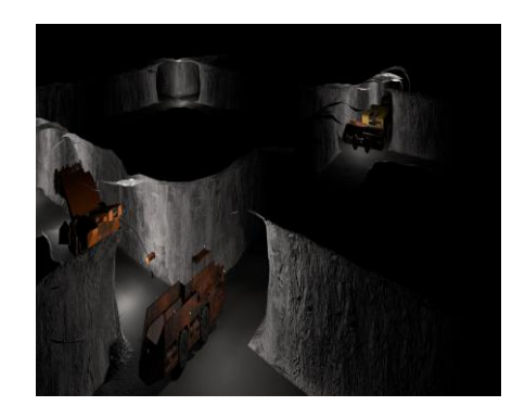
Virtual Reality Mine Simulator (VRMS) for Improving Safety and Productivity in Coal Mines