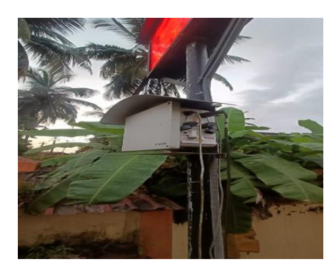
Advanced Al-powered air quality monitoring system