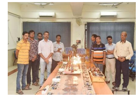
Hybrid charging system for e-vehicles