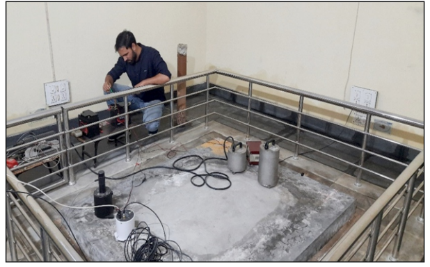
Broadband, Analog and Short Period sensors installed on a concrete pillar