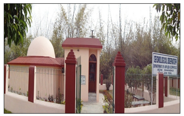
Panoramic view of observatory

Seismological Observatory at IIT(ISM) Dhanbad has been established to understanding earthquake-related phenomena and their effects through the development and application of innovative seismological research methods to build an earthquake-resilient society.