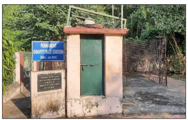
Permanent Gravity Base Station