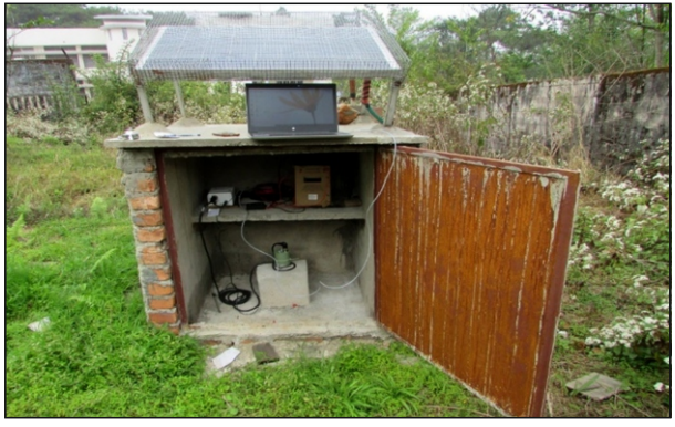
Broadband Seismometer Installed at Peterbar (Jharkhand)